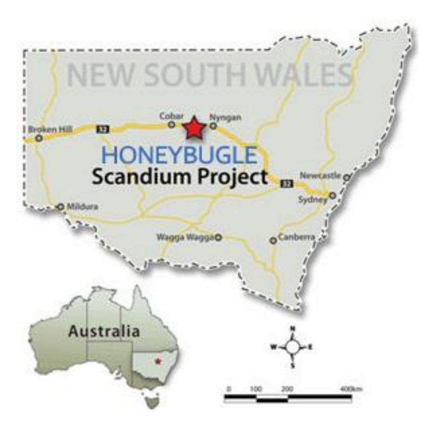
Figure 4. Location of Honeybugle Scandium property