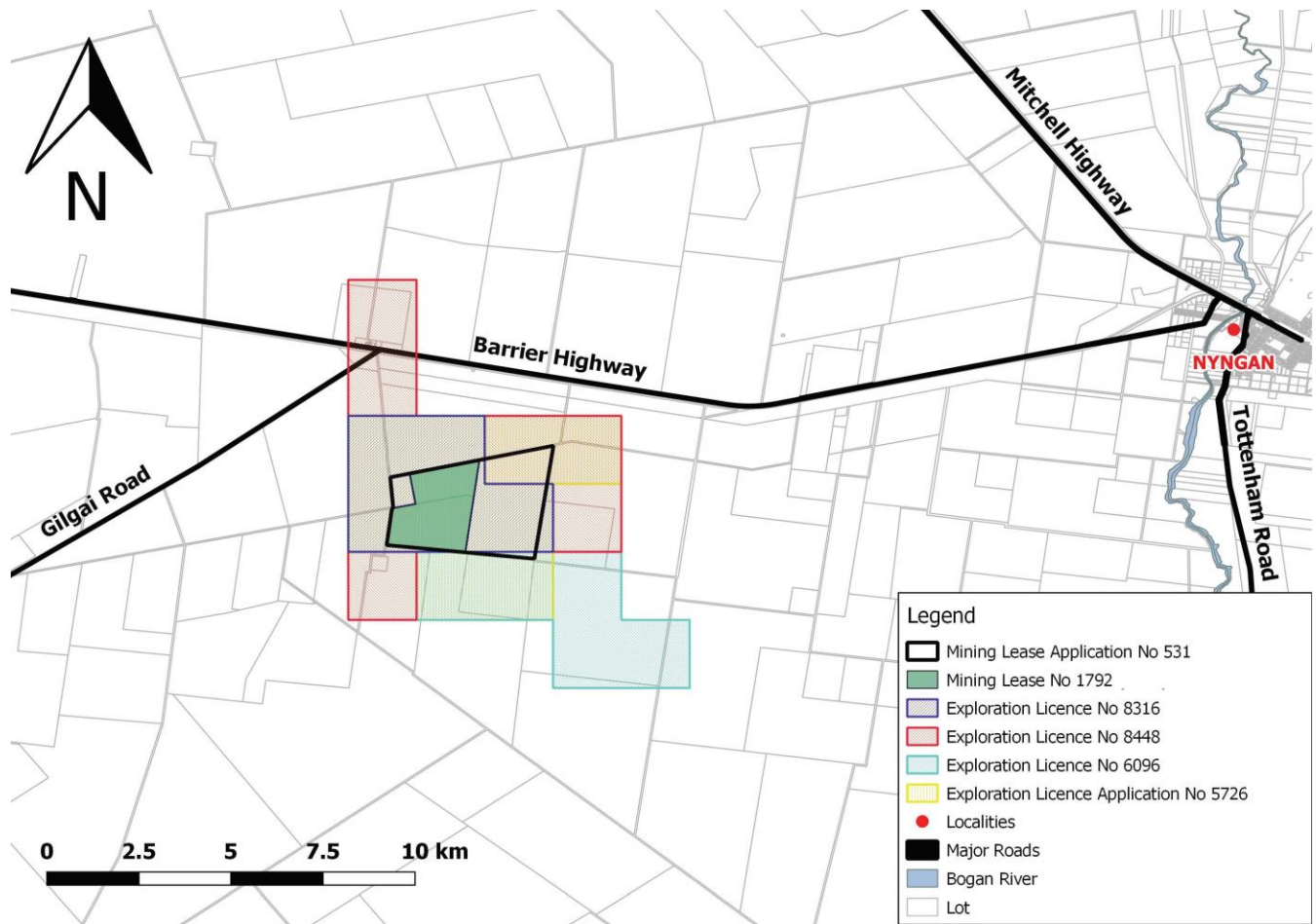
Figure 2: Location of the Exploration Licenses and Mining Lease for the Nyngan Scandium Project

Note: All Exploration Licenses and Leases described in Figure 2 are held 100% by EMC-A.