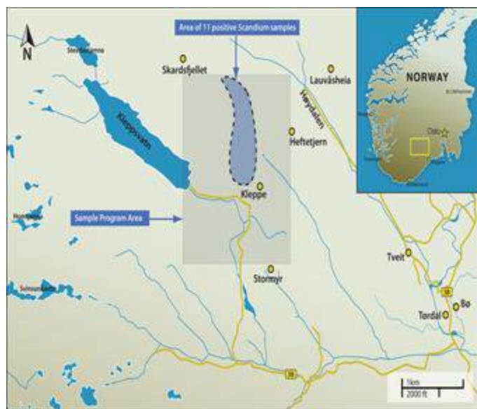
Figure 3. Location of the Tørdal Exploration Property